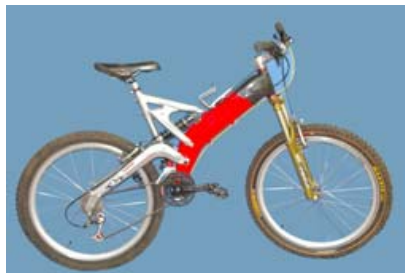
San Andreas Mountain Cycle $650.00