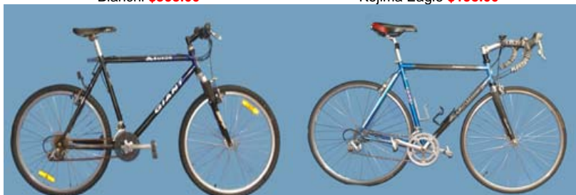
Giant MTB $50.00